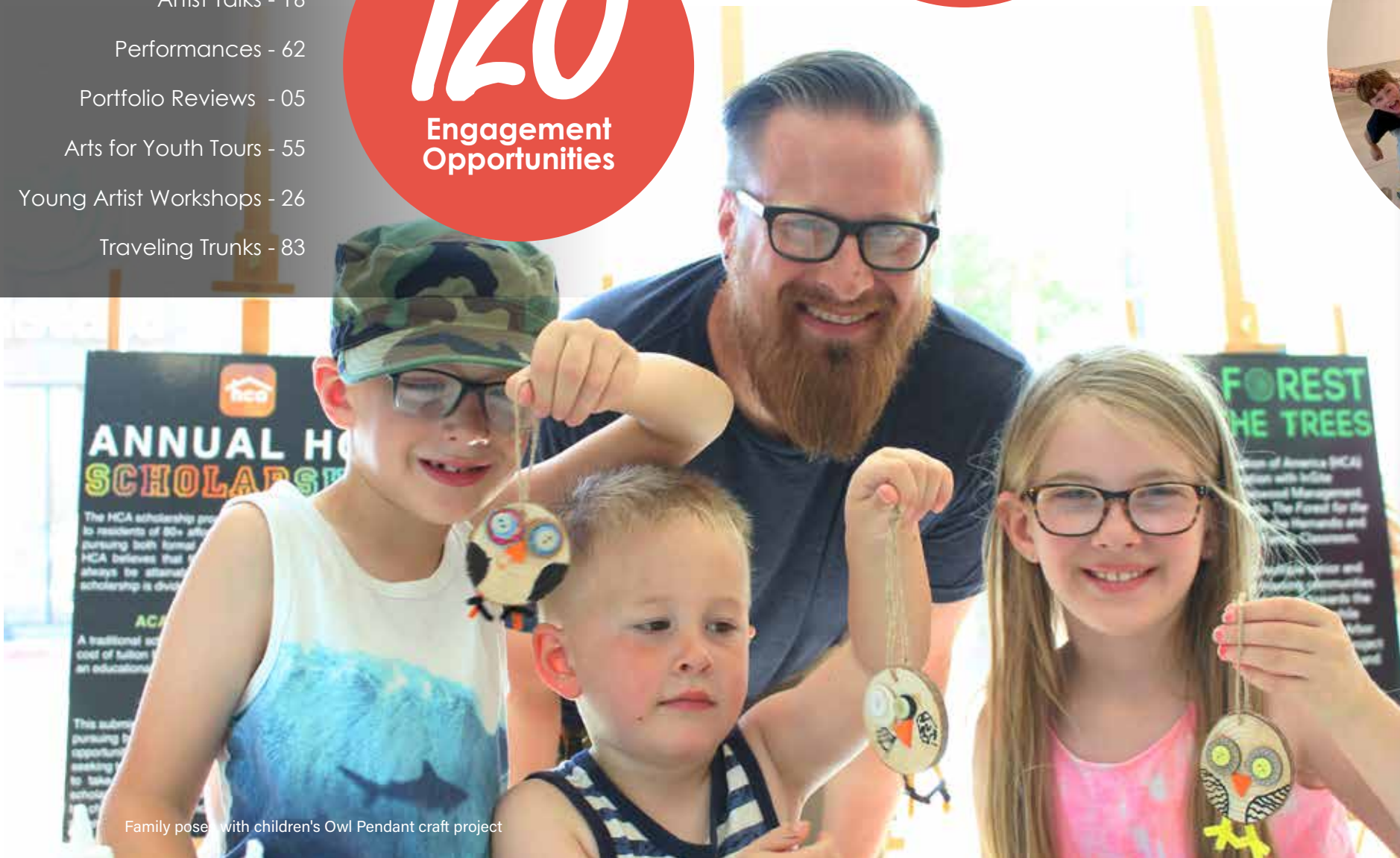
Family poses with children's Owl Pendant craft project