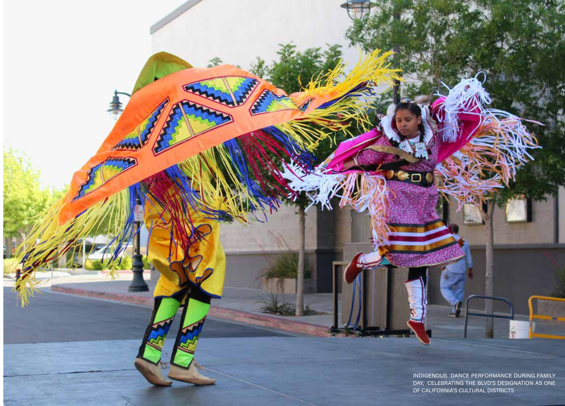
INDIGENOUS DANCE PERFORMANCE DURING FAMILY DAY, CELEBRATING THE BLVD'S DESIGNATION AS ONE OF CALIFORNIA'S CULTURAL DISTRICTS

MOAH LANCASTER MUSEUM & PUBLIC ART FOUNDATION