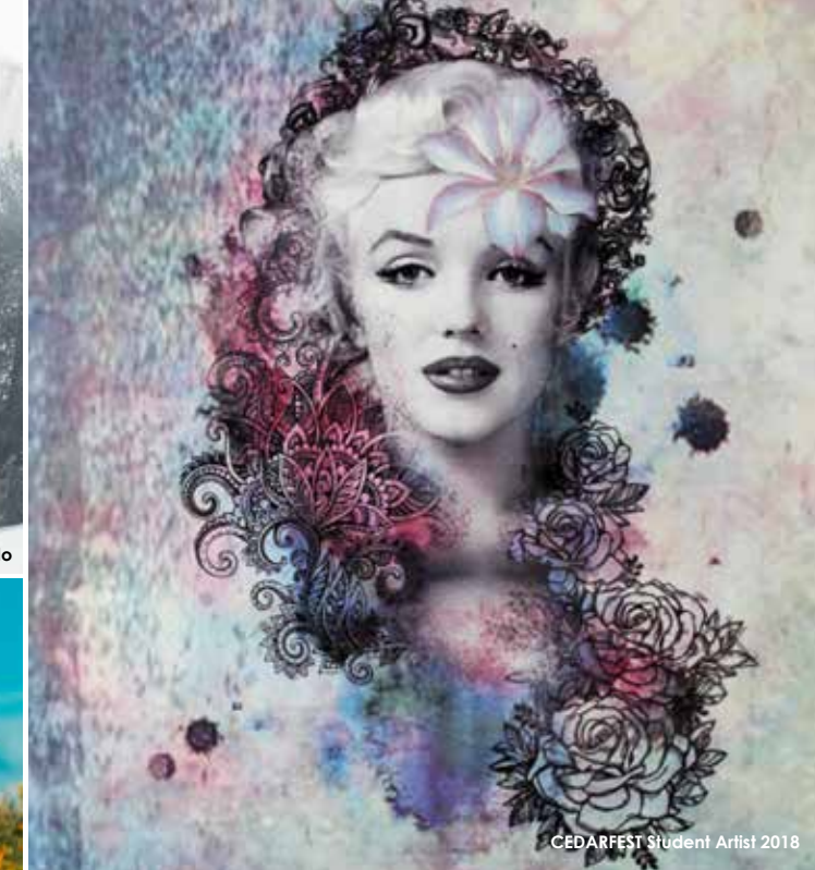
CEDARFEST Student Artist 2018