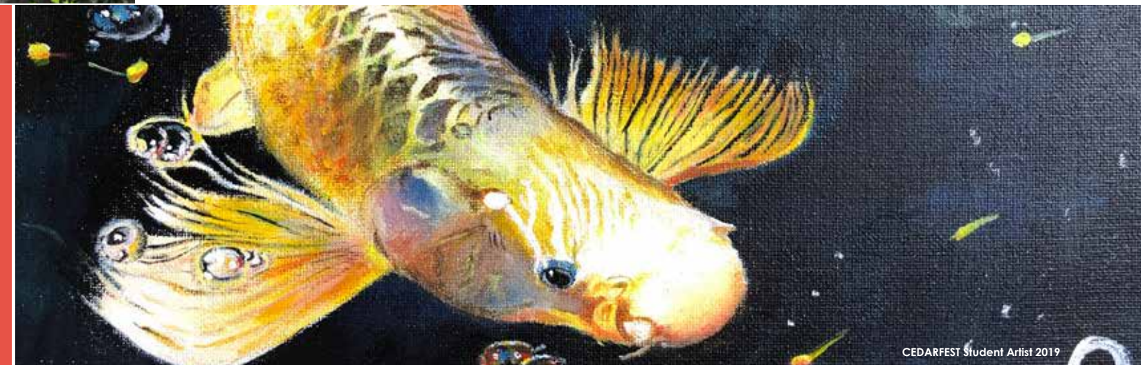
CEDARFEST Student Artist 2019

ARTISTS EXHIBITED WORK AT MOAH:CEDAR IN 2019